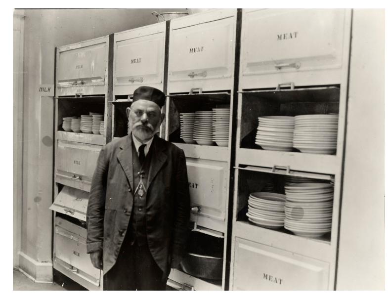
Figure 1. The mashgiach at the JCRS's kosher kitchen, c. 1930s.

In the late nineteenth and early twentieth century, tuberculosis was the leading cause of death