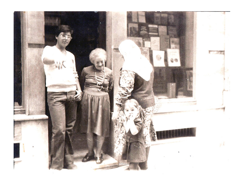
Figure 6. The Kohen Sisters Bookstore, year unknown (The-Kohen Bookstore website; <a href="http://www.kohenkitap.com/Hakkimizda,DP-7.html">http://www.kohenkitap.com/Hakkimizda,DP-7.html</a>)

the illustrated Nazi propaganda Signal and the fascist Tempo magazines (Scognamillo 2002, 97). Other printed matter sold in the store included French textbooks; in the 1970s, the Kohen sisters provided imported books to all the French schools in Istanbul (Kohen Bookstore Website 2017).