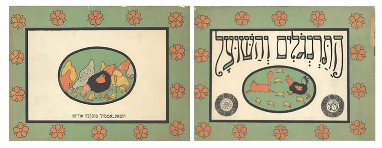
Figure 5. Back Cover ( left ) and cover ( right ) of ha-Tarnegolim veha-shu'al (The roosters and the fox), with place of publication: Moscow–Odessa: Omanut Press. (Hebraic Section, African and Middle Eastern Division, Library of Congress)

Bialik in fact adapted the story from Mishle shu'alim , a collection of rhymed Hebrew fox-fables by Berechiah ha-Nakdan, a Jewish scholar who apparently lived in England towards the end of the twelve century (Ofek 1988, 223–224). But then Berechiah had done some adapting of his own, taking his tales from sources as diverse as Aesop's Fables and the Talmud.<sup>14</sup> Bialik's name does not appear on the book itself, but indeed none of the picture books in the Gamliel Library with the exception of the first three books translated from the Russian—mentions the name of the author or translator.