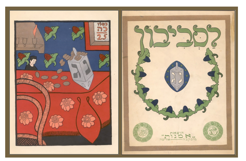
Figures 6. Cover ( left ) and full-page ( right ) illustration from la-Sevivon ( To the dreidel ). Moscow–Odessa: Omanut Press, Sifriyah Gamliel [1919/1920]. (Hebraic Section, African and Middle Eastern Division, Library of Congress)

Ofek (ibid., 224) suggests that Bialik had a hand in at least one other book in the Gamliel Library, he-Hatul veha-shu'al (The cat and the fox), a suggestion with which Gordon agrees on stylistic grounds (2005, 111). But Bialik was not the only star in this constellation of Hebrew writers taking part in the Gamliel Shneur. Library. Zalman celebrated novelist in both Hebrew and Yiddish, wrote the lilting rhymes for one of the most beautiful books in the series, la-Sevivon (To the dreidel; Figure 6).