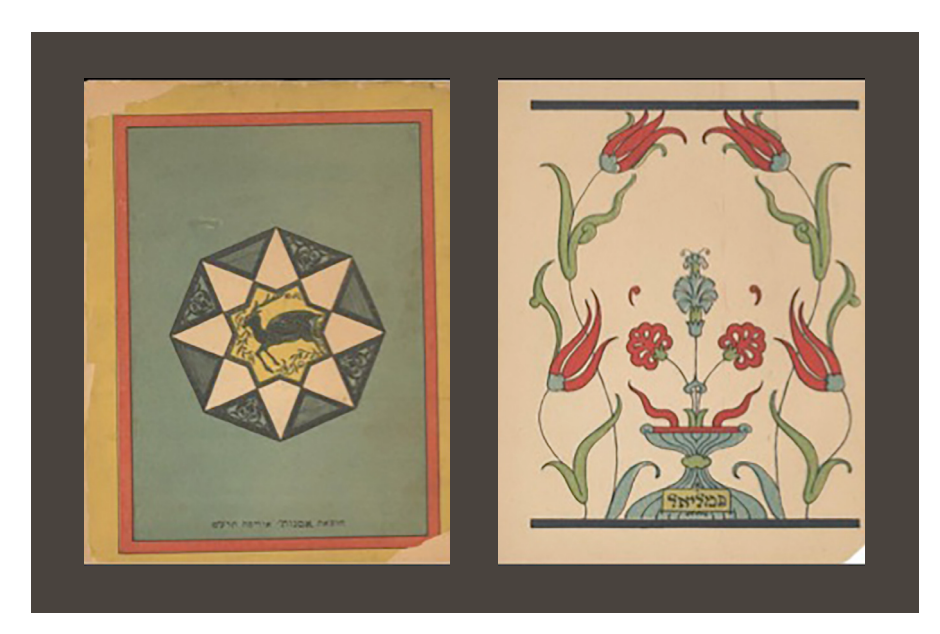
Figure 3. Back cover (left) of Oniyat kesamim (The magic ship), bearing the place and date of printing: Odessa: Omanut Press, 1919/1920; and Verso of front cover (right) , with the name "Gamliel" at the root of the tree (Hebraic Section, African and Middle Eastern Division, Library of Congress)

Oniyat kesamim is unusual in that it is the only one of the books in the Gamliel Library to note the place and date of publication, which it does on the back cover: Odessa, 1919/1920 (Figure 3). It is also one of only two books in the series to bear the image we see in Figure 4; the other book being ha-Oniyah veha-arbah , likewise illustrated by Dmitry Mitrohin. This image appears on the verso of the cover of both books and is full-page.