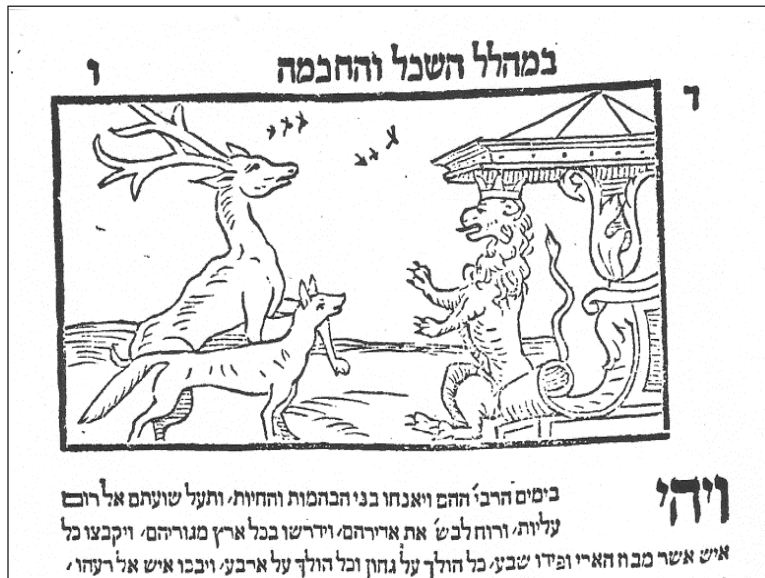
Figure 7. Meshal ha-kadmoni, ca. 1547. The illustration is from this edition, as no copy from the 1610 edition is available

Copenhagen, the other in the Valmadonna Trust Library, each of only four leaves. It is possible that printing was discontinued prior to completion due to the death of the printer, di Gara. The above description is of the ca. 1547 Venice edition (Habermann and Yudlov 1981, 131, no. 273; Habermann 1961, 106 no. 12; Valmadonna Trust and Hill 1989 n32; Waxman [1933] 1960, II, 596–597).