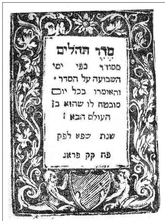
Figure 2. Tehilim, Prague, 1621.

The only known example of this unicum of Psalms, offered for sale by Kestenbaum and Company, was part of the library of the Order of Jesuits in Olomouc (Olmütz, Moravia), known from an upside down inscription on the title page dated 1739 (Kestenbaum 1998, 18–19, no. 38).