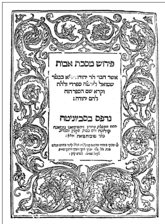
Figure 5. Lehem Yehudah , 1553

The burning of the Talmud in Italy was not limited to that work, many other unrelated books being swept up in the mindless fury of destruction. A notable example is Lehem Yehudah (Figure 5), a commentary on Pirke Avot by Rabbi Judah ben Samuel Lerma Sephardi, of whom little is known except for the events related to the publication of his book. That work is a commentary of a philosophic but traditional nature, based on the writings of Rabbi Joseph Albo, Don Isaac Abrabanel, and Rabbi Isaac Arama, as well as Talmudic and Midrashic sources. Nevertheless, Lerma is an original thinker, often expressing his own views.