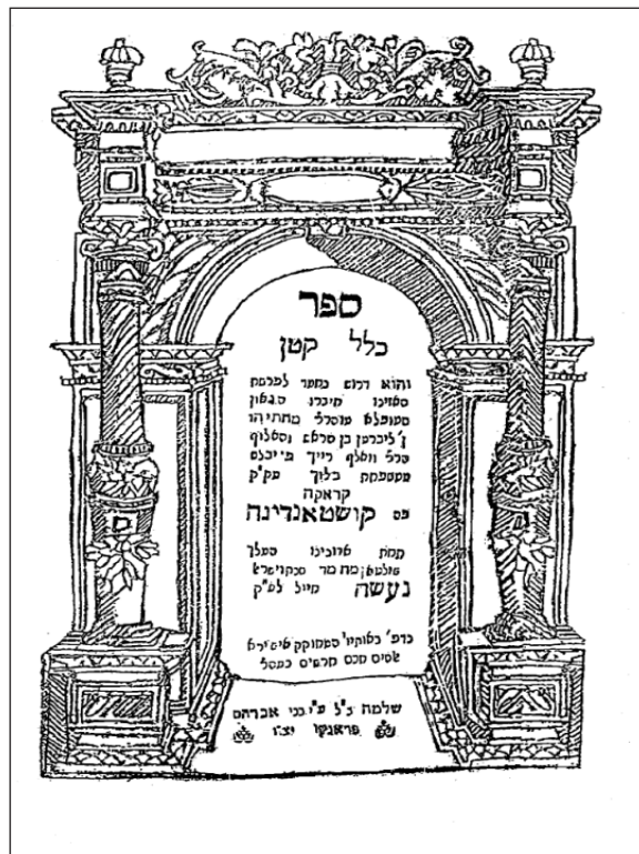
Figure 6. Kelal ḳatan , 1665