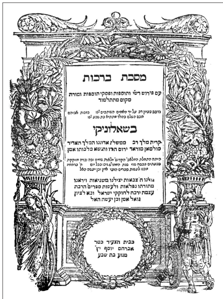
Figure 3. Tractate Berakhot , Salonika, 1592

Italy through Venice, a trading partner of the Jews in Salonika. It is not known if tractates other than Berakhot were published (Heller 2008, 284–297). Sabbatai Mattathias died in 1601. The Bath-Sheba press continued to publish Hebrew books, albeit in diminishing numbers, under the management of his sons until 1605. It is credited with about forty titles from 1592 to 1605.