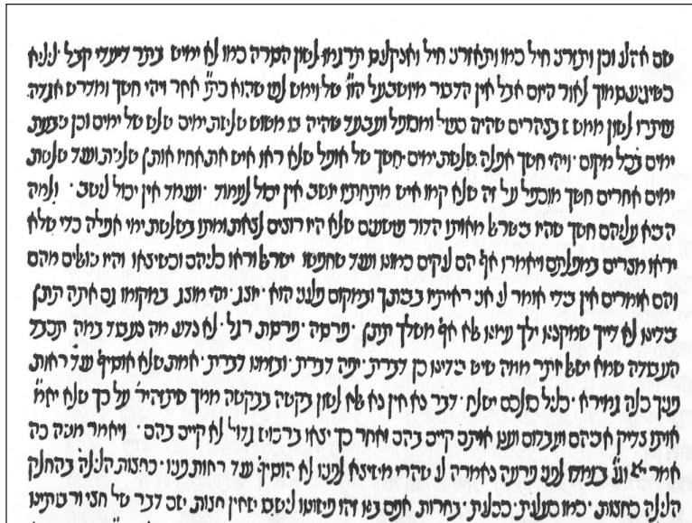
Figure 1. Rashi's Torah commentary, Reggio di Calabria, 1475

leaves, in the Biblioteca Palatina in Parma (Freimann and Marx [1924] 1968, A1, 1–3; Åkerson 2004, no. 31; Offenbergh and Walraven 1990, 147, no. 112). 7 Printed as a folio ([118] ff.) in a Sephardic semi-cursive font comparable to that used in Spanish manuscripts, it is the only title known to have been printed by Abraham Garton (Figure 1).