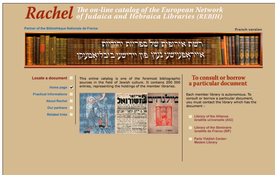
Figure 1. Homepage of the union catalog Rachel.

Containing the bibliographic records for materials from the six libraries and the online video recordings of Akadem Multimedia, the union catalog Rachel, at http://www.rachelnet.net , is the main tool created by the REBJH. As of February 2012, there were 183,486 bibliographic records in Rachel. Being a full partner of the BnF, the REBJH aims to enhance access to all Jewish Studies resources in France. From the outset, the REBJH aspired both to increase the discoverability of Judaica and Hebraica resources in French libraries and ultimately to collaborate with European libraries in the field of Jewish Studies. Towards this end, Rachel had to solve several technical problems in the cataloging process and in the formatting of bibliographic records.