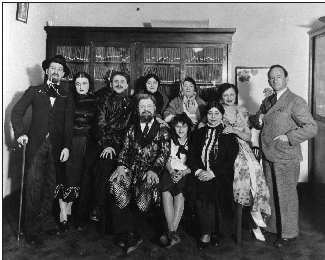
The Calgary Peretz Shule's Dramatic Club, waiting in the library to go on stage for an unidentified production.