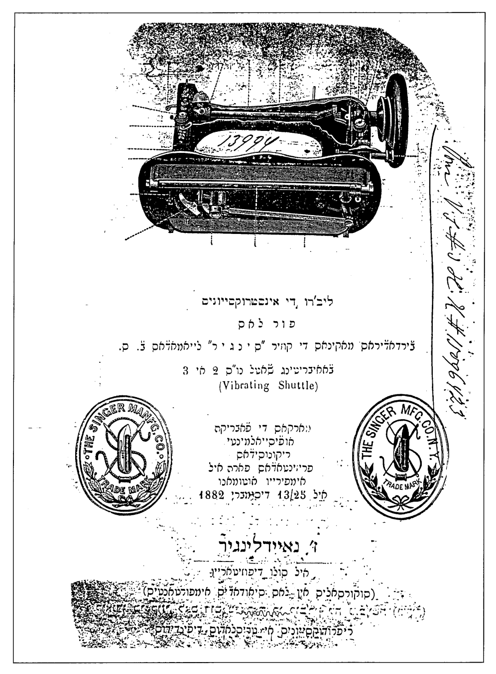
Figure 3. Livro de instruksiyones por las verdaderas makinas de kozer "Singer" lyamadas V. S.: Vaaibreţing shoţl nu"m 2 i 3 (Vibrating shuttle). Not all words on a Ladino/Judezmo title-page derive from Spanish or Hebrew.

was published posthumously (with editorial emendations) and is regrettably flawed by numerous typographical errors and questionable etymologies. Still, it remains the best extant source for the phonetic transcription of Judezmo. Its Romanization table (pp. [xiii—xv]) is based in part on modern Spanish (e.g., "j" is employed as in Spanish), although diacritics conforming to Judezmo pronunciation are also employed. Words of Hebrew and Turkish derivation are identified, and their pronunciations are given. Unfortunately, the Nehama dictionary is out of print, though it is held by many major research libraries.