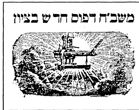
The new Hebrew printing press in Jerusalem, from Hayim Vital, Sefer ha-Goralot (Jerusalem, 1863). BL 1969. b. 58

The Schocken Library also contains the archival collection of Moses Nahum Jerusalimski of Kamenka (1855-1914), a