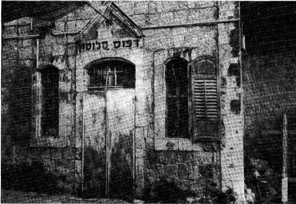
“Salomon’s Press” in Jerusalem, 1990.

gave me some of his own bibliographies to read while he concocted a wonderful pickle broth in the kitchen.